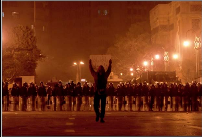
EGYPTIAN REVOLUTION 2011