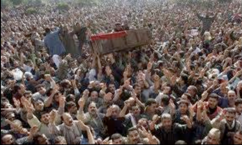
Mahalla protests, April 6th 2008