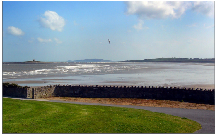
The Irish Sea, just north of Dublin. For many of those in the inner-city, the promise of Ireland’s economic renaissance is still out of reach. But slowly, the generations of manual labor are giving way to new economic opportunities on the Emerald Isle.